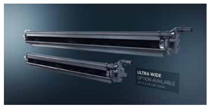
Baldwin Technology's FlexoCleanerBrush enabled Dusobox to bring average end-of-job cleaning time down to four minutes.

The FlexoCleanerBrush automated this process, bringing average end-of-job cleaning time down to four minutes. In addition, automating the hickey-picking process reduced the time spent from about five minutes to less than five seconds with just the push of a button. These time savings have the potential to increase production by thousands of square meters per year.